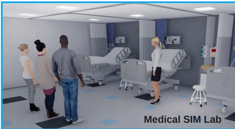
Medical SIM Lab