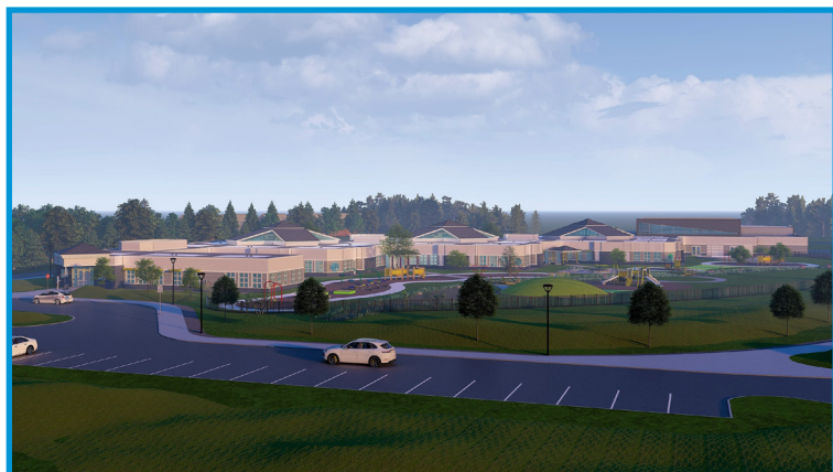
A view of the Early Childhood Center from Newburgh.

A joyful and engaging place for young children to learn and grow. That's the idea and the dream behind Livonia Public Schools' new early childhood center, which broke ground this spring.