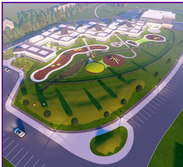
A birdseye-view of the planned facility's exterior.

LPS will announce the grand opening date and invite the community to come and celebrate this new addition to Livonia Public Schools. Stay tuned!